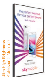
Ultra High Brightness Professional Monitors

Thanks to their special ultra-high brightness panels, these displays can withstand surface temperatures up to 110°C without suffering from any blackening defect. This is crucial for outward-facing window displays, which must contend with exposure to direct sunlight.