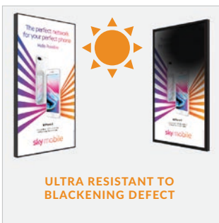
ULTRA RESISTANT TO BLACKENING DEFECT