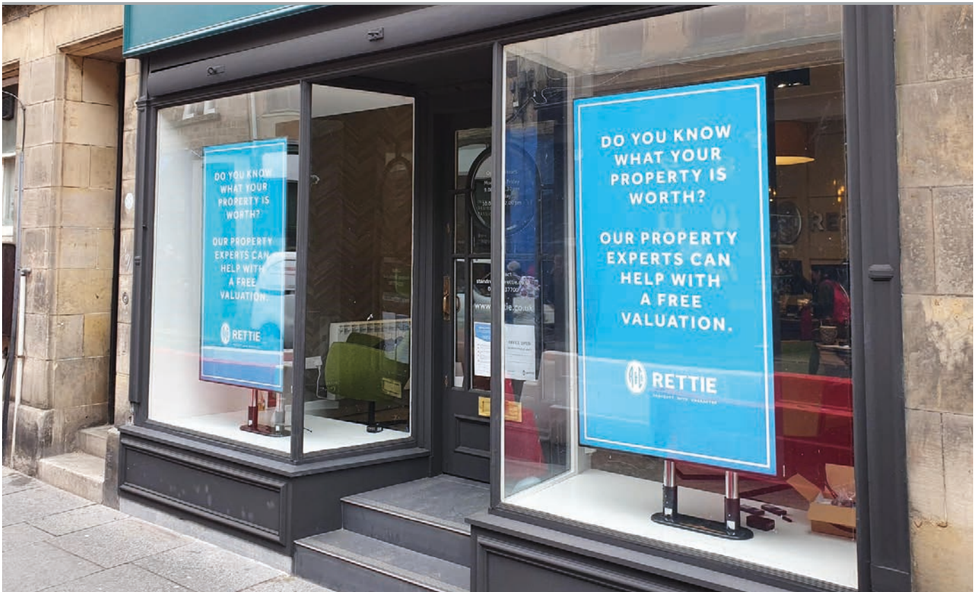
Designed for outward-facing window displays in direct sunlight