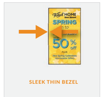
SLEEK THIN BEZEL