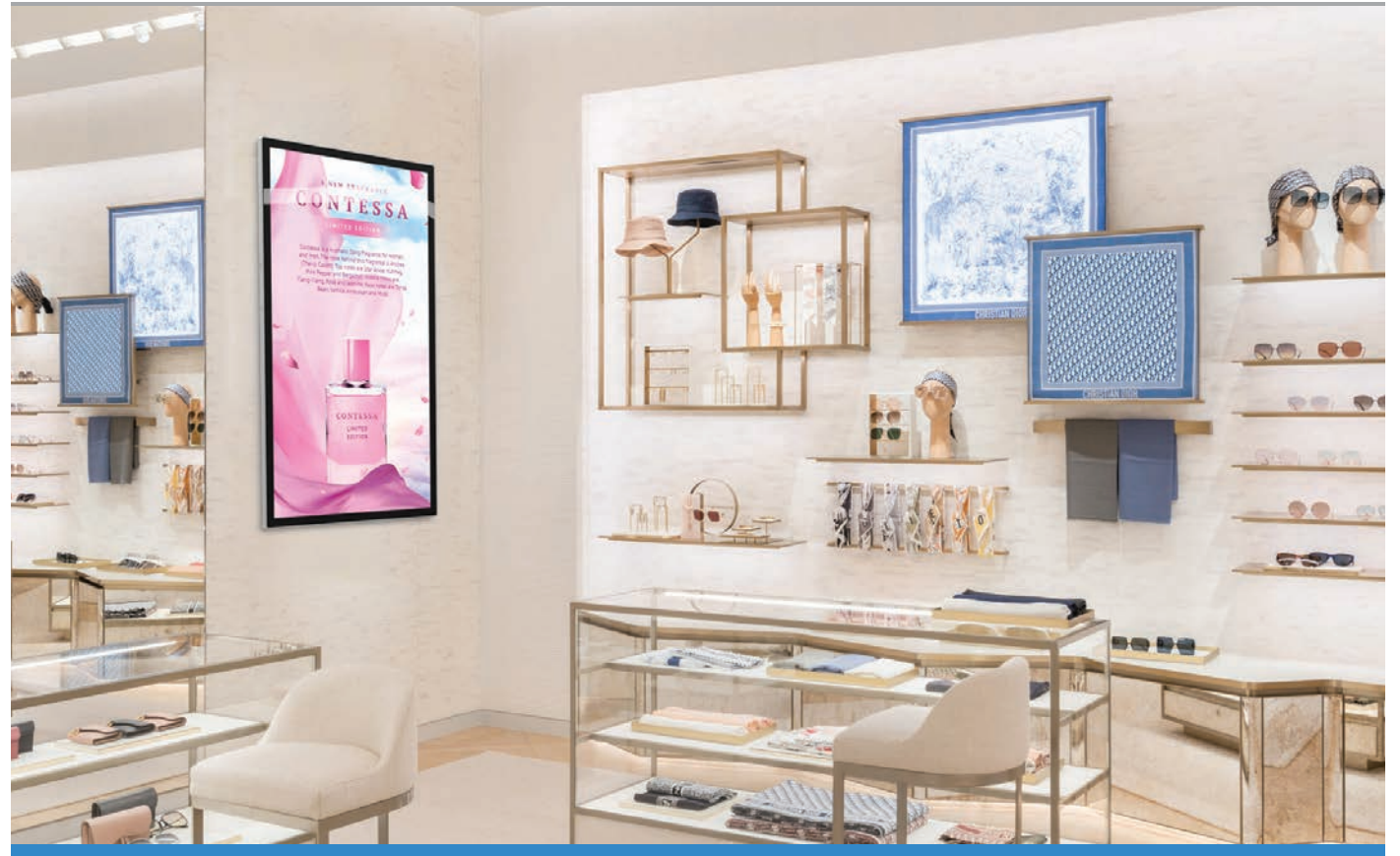
Premium displays that combine stunning tablet-like aesthetics with a robust protective enclosure and tempered glass face