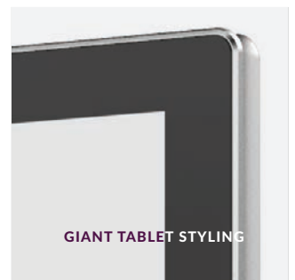
GIANT TABLET STYLING