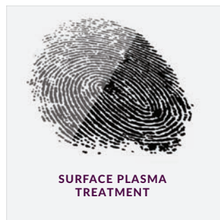
SURFACE PLASMA TREATMENT