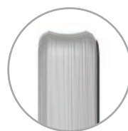
Concave Indent Profile