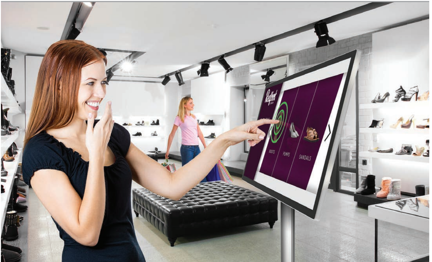
Perfect for interactive experiences, such as wayfinding and product browsing