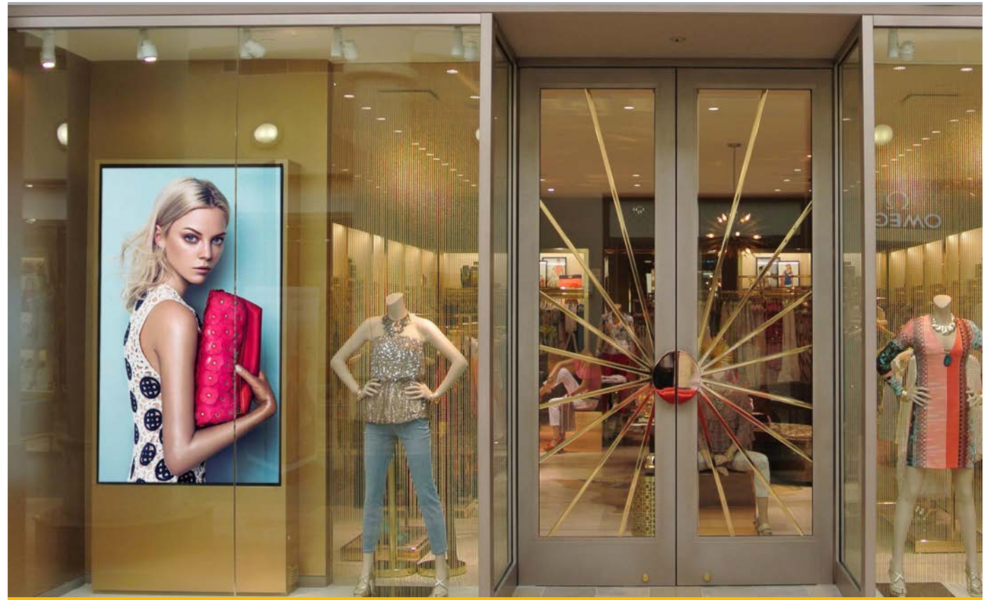
Designed for outward-facing window displays