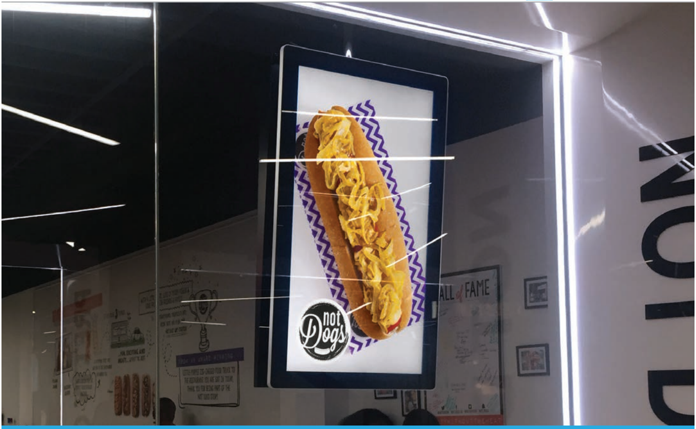
Stunning displays that combine tablet-like aesthetics with a robust mild steel enclosure and tempered glass face