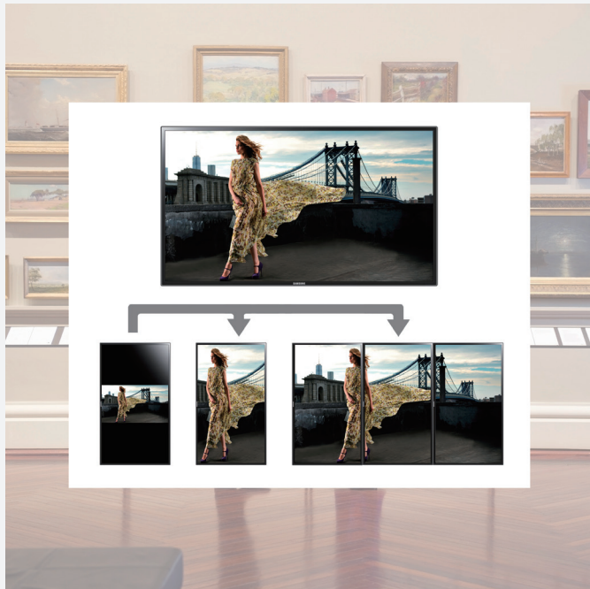
Figure 3. Portrait to landscape image rotation enhances usability with no loss of resolution

UED Series displays offer pivoting capability and image rotation software that can change image orientation from portrait to landscape for greater display flexibility. For convenience when rotating images, two ratio options are available: original ratio or auto full-sizing ratio. Users do not need to rotate a picture in the software to make it appear correctly in a different orientation.