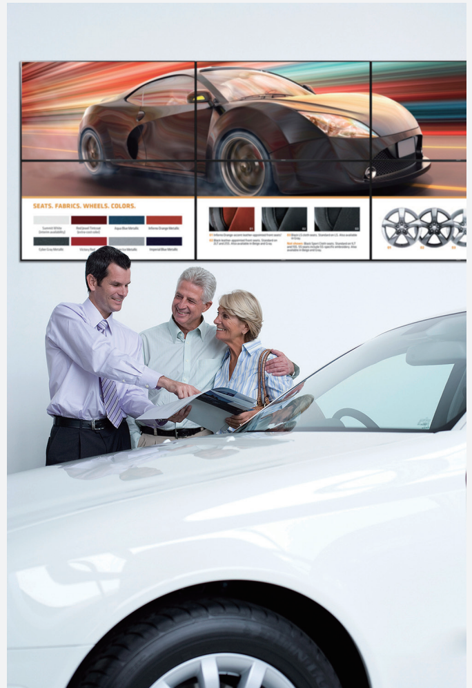
Figure 2. Improved video wall color calibration for color uniformity

The integrated factory color tuning process has been refined for white balancing and color difference compensation, resulting in improved color temperature matching. The Samsung Color Expert software with built-in ACM chipset is also enhanced for ease of use and performance and offers three options: gamma calibration, local uniformity and white balance. The calibration speed is higher and the user interface (UI) is augmented for more precise color management. Light reflection, absorption and scatter are significantly reduced with the help of the Ultra Clear Panel. As a result of Ultra Clear Panel technology, images are brighter and sharper, which ultimately improves content visibility.